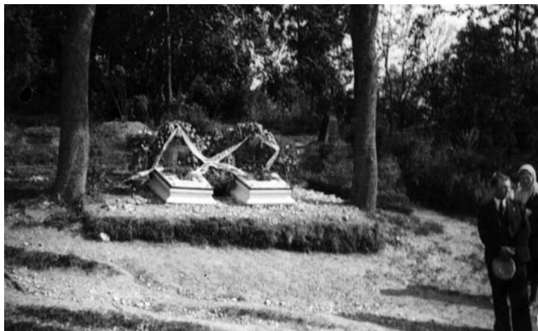
Grave of Rainiai martyrs.

The Telšiai prison a red-brick building is located almost in the centre of the town. The cell in which the political prisoners had written the widely known testament on a bowl is on the first floor. The prison workshop was in front of it. The cell was quite small. Only a few people could under normal standards be placed there, however, these Bolsheviks held as many as 13 prisoners in it. Prisoners could not see either the town outside or their surroundings from their cell, only a small part of the blue sky. Other prisoners were held in the next cell, which was arranged at the place of the former prison chapel. Among them was the later murdered Tarvainis, who on seeing the flying of German planes, through a small square of a window, told his friends held in the next cell about the approaching liberation.