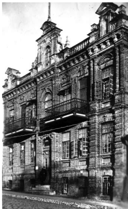
Facade of Telšiai prison.