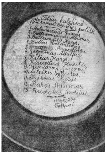
Bowl with inscription.