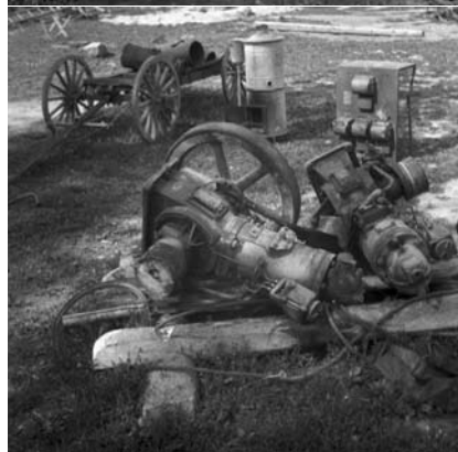
Iron stove to keep the water on the boil. Switch box of the electric set. The political prisoners were tortured with electricity. Engine producing deafening noises.