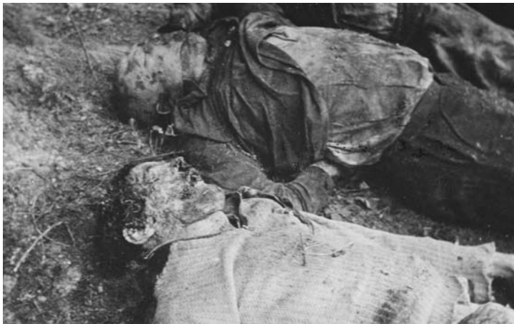
Tortured bodies of political prisoners.