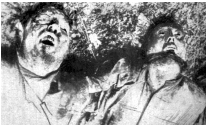
The victims of Rainiai.

wound from inside corner of eye going straight up, 10.4 cm, brain effused; hands violently beaten, left leg beaten and bruised, skin untouched.