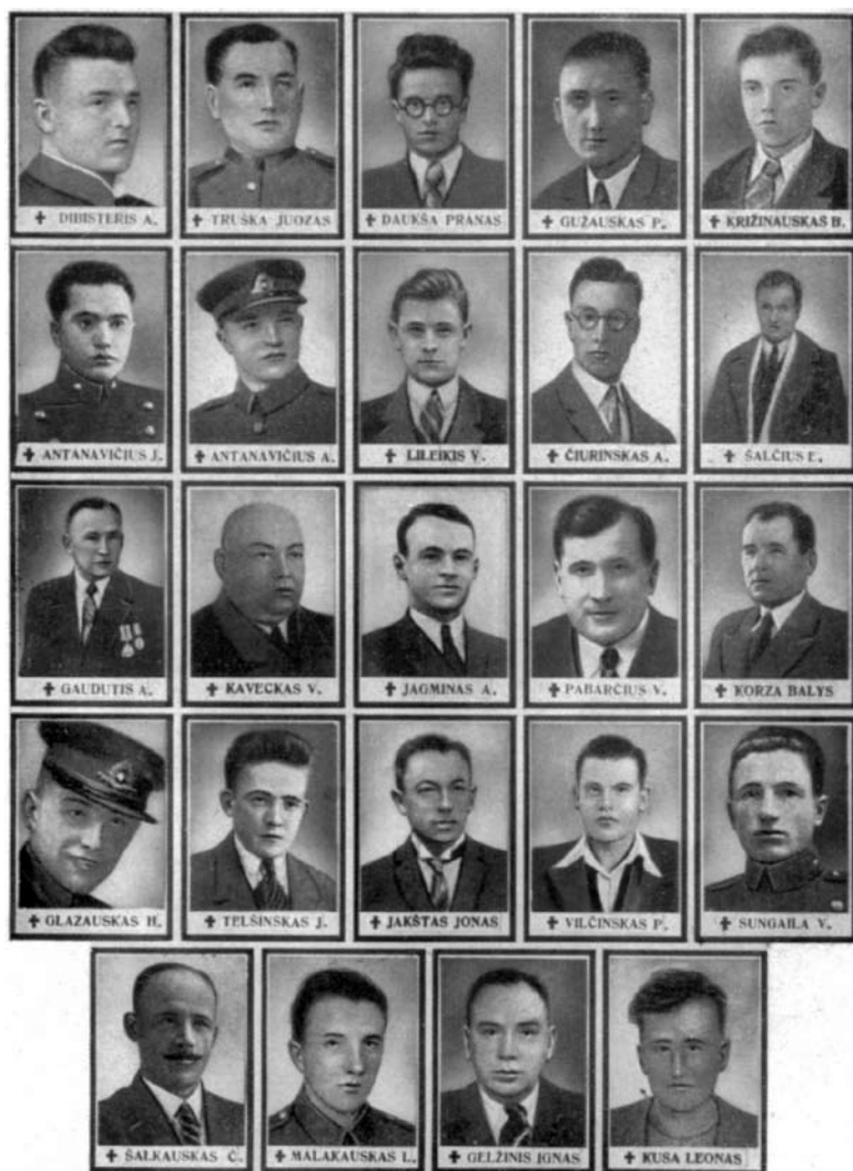
Farmers who were murdered in Rainiai.