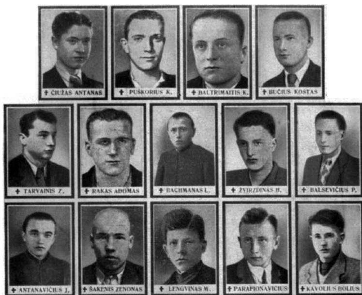
Some of the students of Plungė Commercial Shool and of Telšiai Latin School. All of them were murdered in Rainiai forest after having suffered terrible tortures.