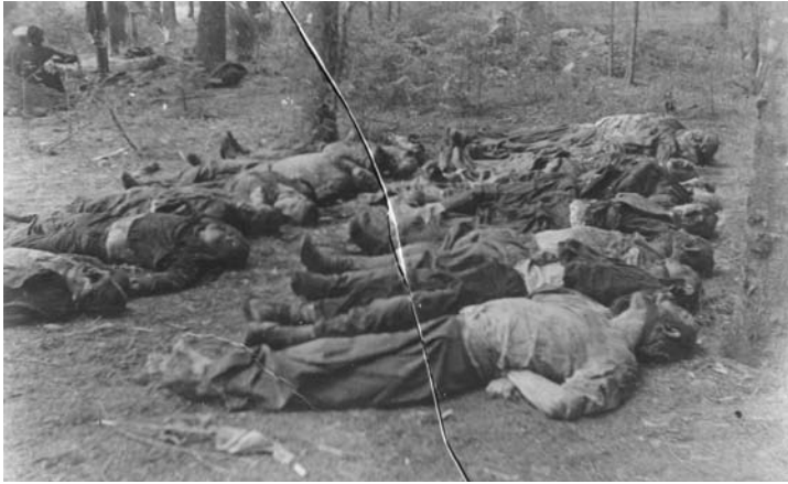
Process of identification.