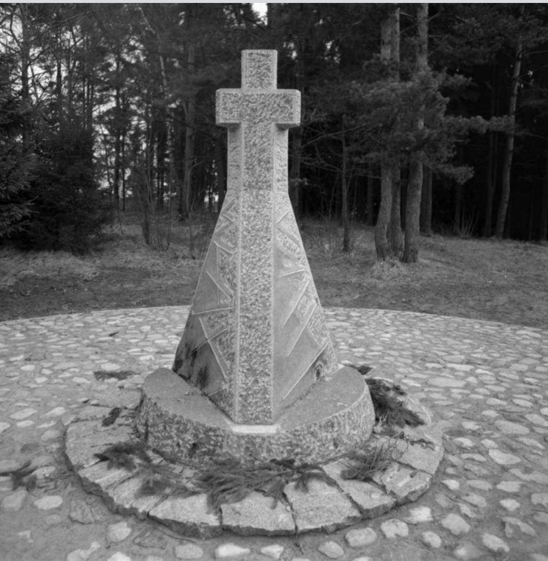
Rainiai forest today.