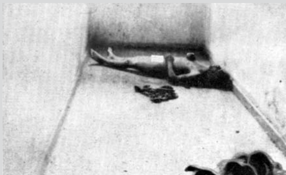
Torture cell at Pravieniškės after the retreat of the Bolsheviks late in June 1941.