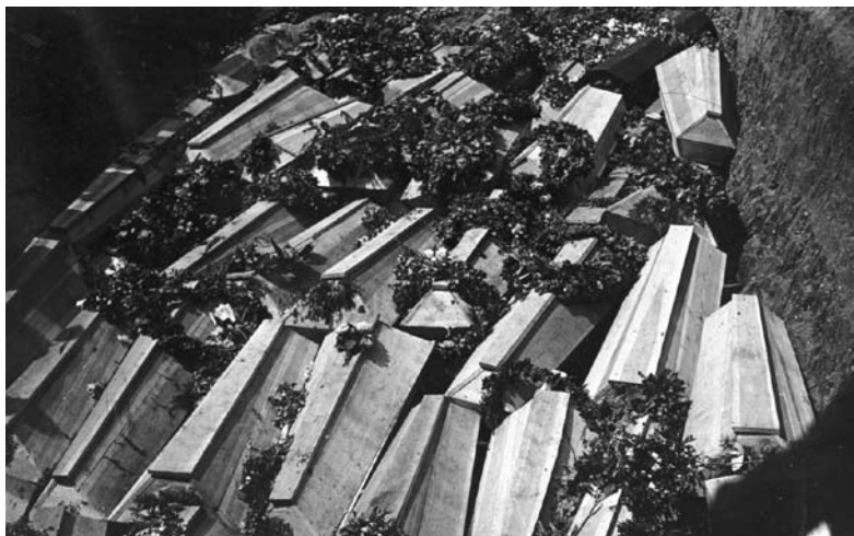
Coffins in the common grave of Rainiai martyrs in Telšiai cemetery.

Tanks took positions in the street on both sides of the prison. Lorries came and drove into the yard of the prison. Gravediggers had already been sent to Rainiai to dig pits, late on the same afternoon.