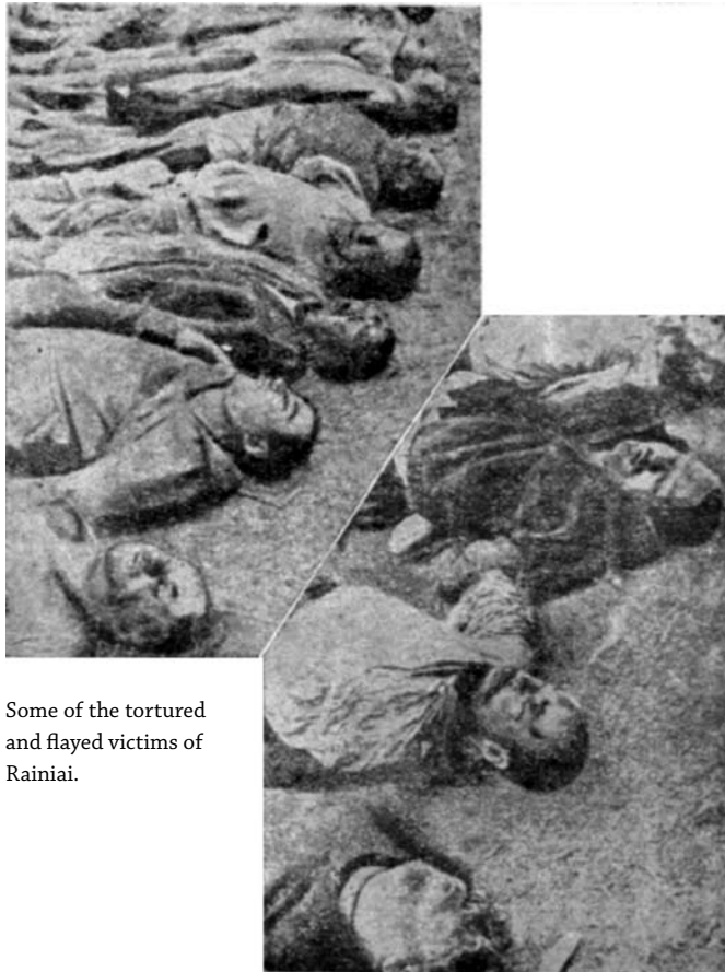
Some of the tortured and flayed victims of Rainiai.