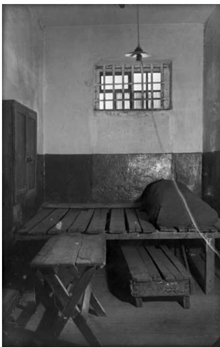
11th cell of Telšiai prison.