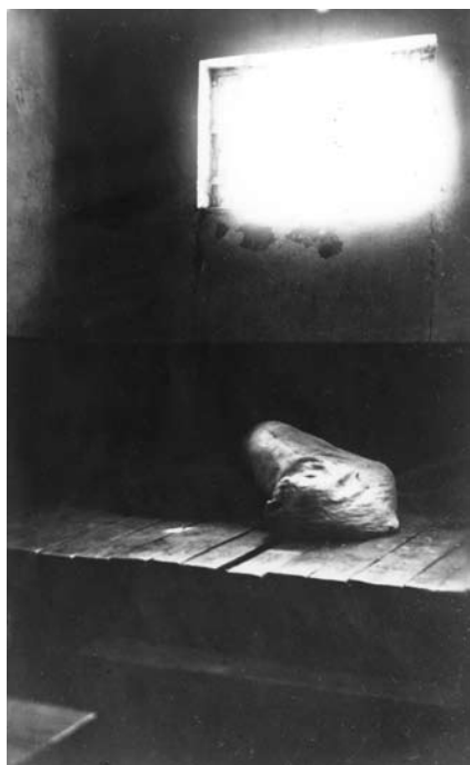
10th cell of Telšiai prison where the bowl with the inscription was found.