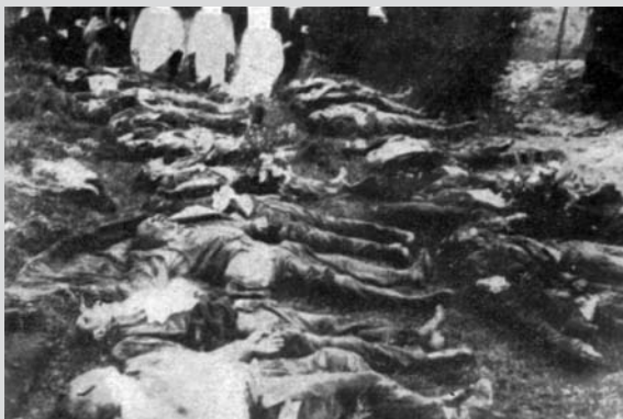
Victims of the cruel crimes of the Bolsheviks at Panevėžys. Those are bodies of workmen who on 26 June 1941 were murdered behind the sugar factory.