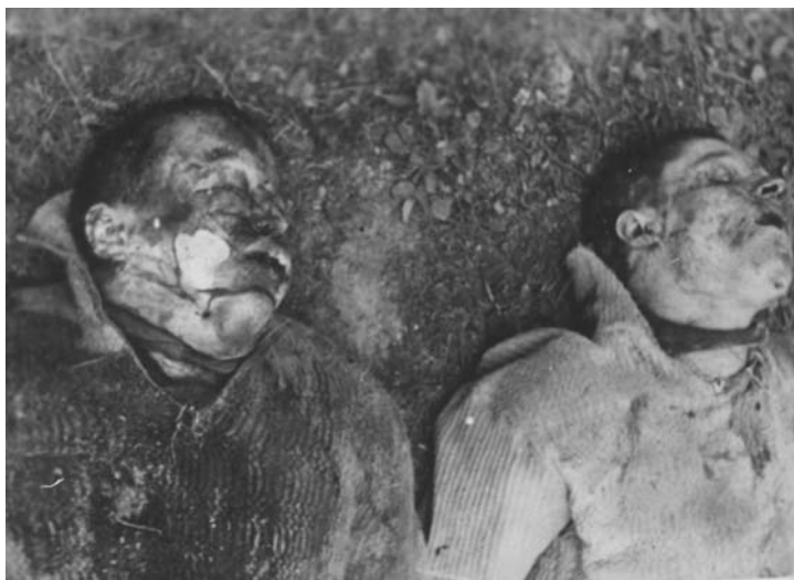
Tortured bodies of political prisoners.

effusing. Edges of the hole uneven, sharp, punched. Hands tied, bones of left arm beaten and broken. Genitalia beaten with a blunt thing. Blood effusion in tissue and skin injuries. Left leg beaten with a blunt thing.