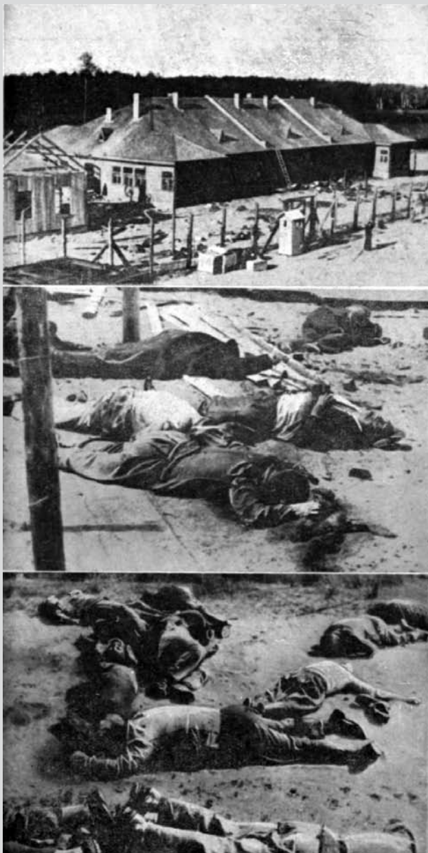
Labour camp at Pravieniškės where the Bolsheviks killed the inmates and the supervising staff of the camp on June 26 1941.