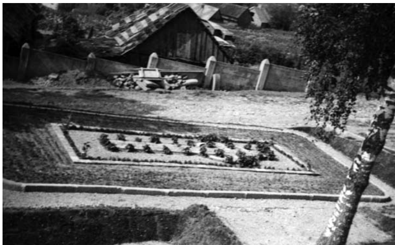
Grave of Rainiai martyrs.

not present at the place of torment and were only passive watchers, maybe, only of things happening elsewhere in the prison. A few warders who escaped (among them the governor of the prison in the Bolshevik times) might have known more. Currently the only of the escaped warders, Kabaila, who had been mentioned in the testament of the martyrs as a cruel supervisor, was caught; however, during interrogations he still remained silent. The only thing determined was that during the torturing, the engines of some vehicles were kept running and a special motor was installed to mute the shouts of the people being tortured. The corpses of the martyrs were encountered casually. Local guerrillas searching for hidden guns; starting to dig the ground picked up the killed. They also came upon a kettle with the water in it; water was boiled for scalding hands, and nearby a heap of skin scalded from arms and legs was found. No need to go on writing about other injuries on faces, arms, skin, heads and cutting off of extremities, because the press has already written extensively on that topic and data of official medical experts was publicized.