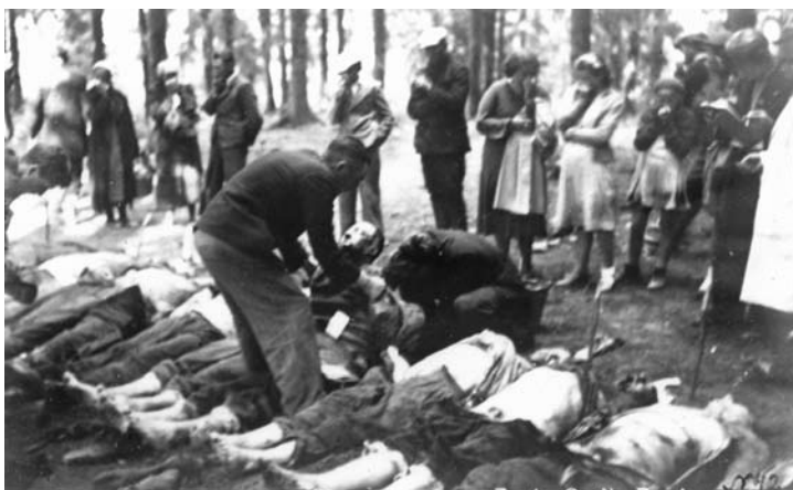
Discovered martyrs were laid down into the rows for identification.