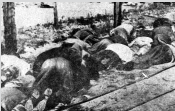
Disarmed camp staff was lined up against a barrack wall and shot at Pravieniškės on 26 June, 1941.