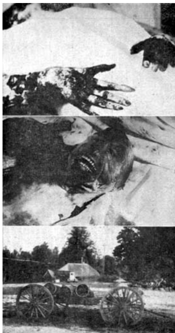
The Bolsheviks conveyed boiling water to the selected place for torturing. Pictures show a scalded head and burnt hands.