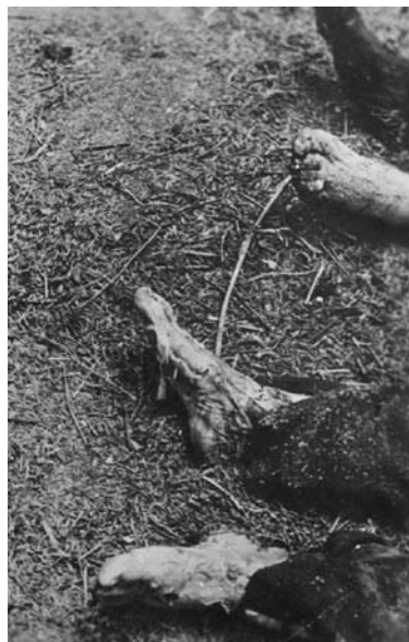
Disfigured feet of martyrs.

victims. They were: singeing their victims on fire, burning them with fire and electricity, and were scalding their hands and legs with boiling water. Later They were beating the martyrs with gun butts, wires with lead pieces on ends and other solid tools, were cutting them with knives, puncturing with bayonets, breaking bones of arms and legs, puncturing their soles, backs, chests, abdomens with bayonets, were peeling skin from various body parts, while people were still alive, were cutting off ears of some of them, puncturing eyes and tearing tongues. Skulls of most martyrs were broken, brains effused. It is also important to note that