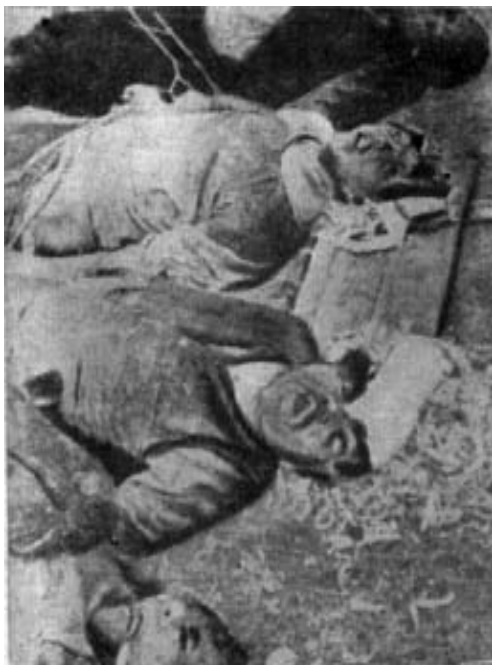
The victims were so mutilated that they could not be identified