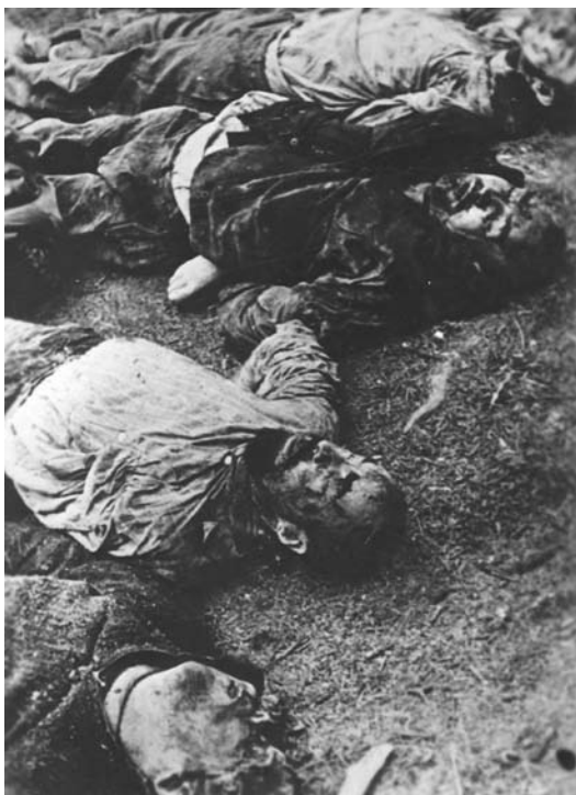
Tortured bodies of political prisoners.

28. Unidentified. Livores mortem on abdomen, body macerated. Genitalia beaten, blood effusions. Gunshot wound on the right side between ribs, blood effusing from the left side.